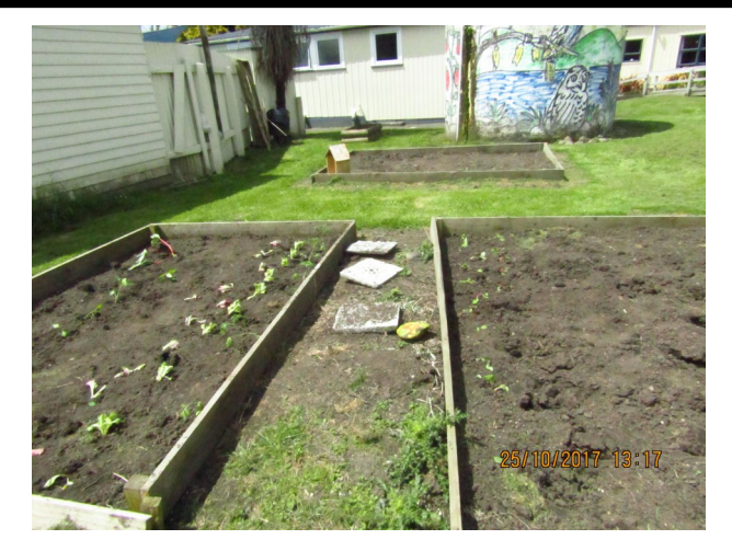
The start of our veggie gardens.....